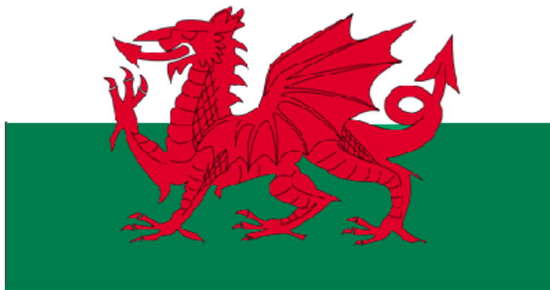
Flag of Wales